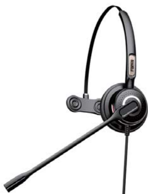
Fanvil - HT201

Fanvil HT201 & HT202 offer a range of premium quality headsets using Fanvil's innovative acoustic technology to deliver speech clarity and an excellent audio experience. Coupled with our sleek design that focuses on comfort and durability, the Fanvil HT201 & HT202 headset offers a new level of experience for call center professionals.