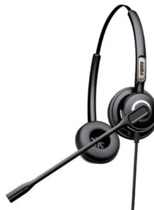
Fanvil - HT202